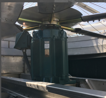
ENDURA DRIVE Direct Drive Motor Retrofit