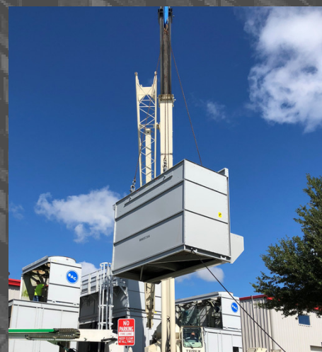
BAC Fluid Cooler Coil Replacement