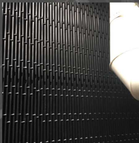
FILL REPLACEMENT BEFORE AND AFTER